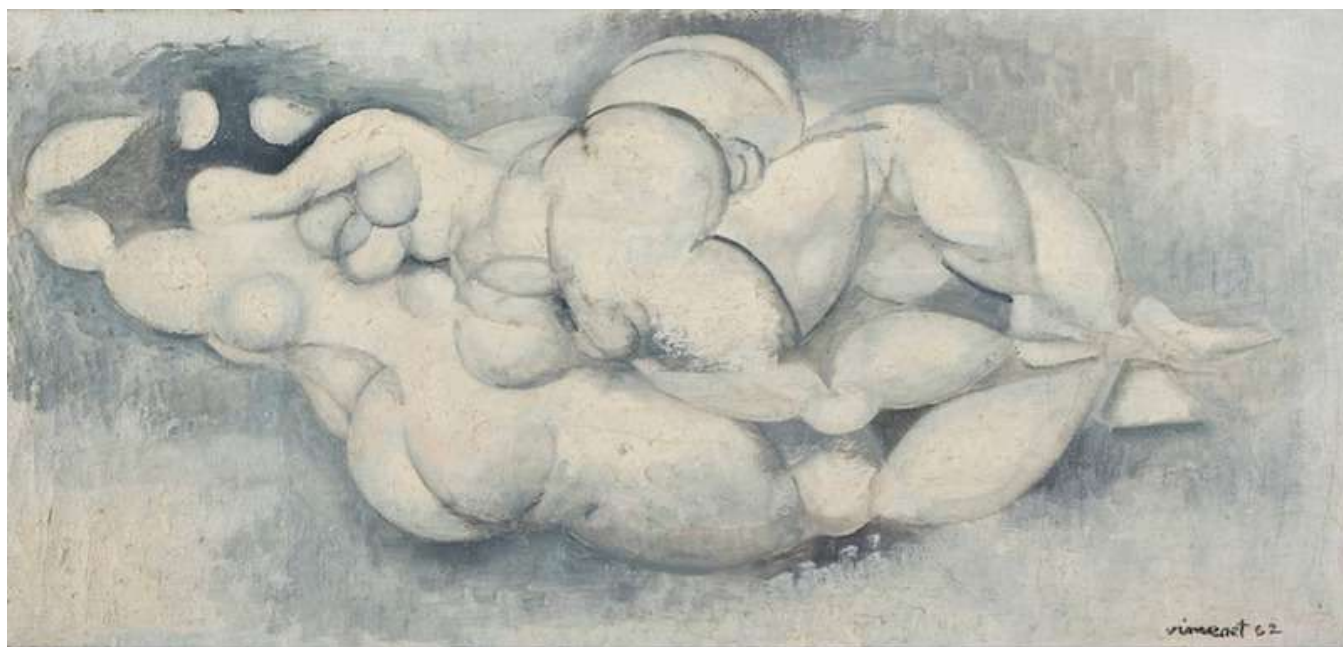
Tribute to Courbet, oil on canvas, 37 x 72, Cachan, 1962

To celebrate the 20th anniversary of the death of Jean Vimenet, the Musée des Beaux-Arts in Lons-le-Saunier will present, from October 25, 2019 until the end of January 2020, an exhibition dedicated to a "Tribute to Courbet". It will bring together about twenty works (paintings, graphic works, sculptures) and various documents by Jean Vimenet around this theme. It will take place simultaneously and in parallel with an exhibition of homage to the sculptor Jean-Joseph Perraud (1819-1876), whose collection of sculptures is the founding of the museum. The latter is celebrating this year the 200th anniversary of the births of Perraud and Courbet. Jean Vimenet is the artist invited by the museum to close this cycle of celebrations.