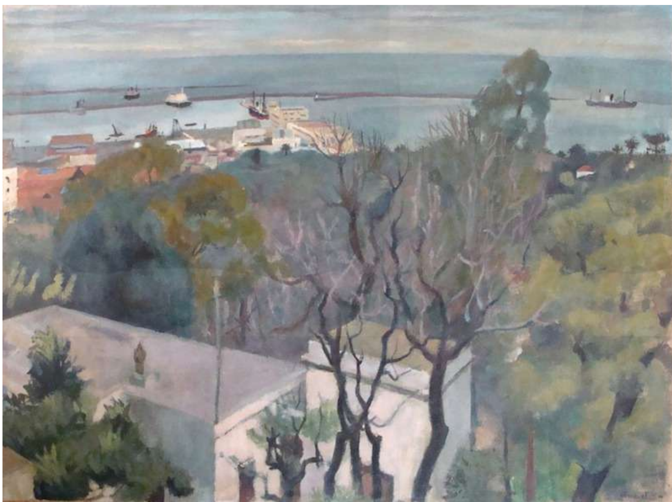
The Bay of Algiers , oil on canvas, 96.5 x 130, Algiers, 1954 [Coll. Museum of Fine Arts of Tours, INV. 2000.6.1]

The Fine Arts Museum of Tours will present, from September 27, 2019 to January 5, 2020, as part of its "Pocket Shows" and to celebrate the 20th anniversary of the death of Jean Vimenet, an exhibition dedicated to the Algerian period of the artist (1952-1954). It will bring together about twenty works and various graphic and photographic documents around the Bay of Algiers (1954), that entered the permanent collections of the museum in 2000 (1).