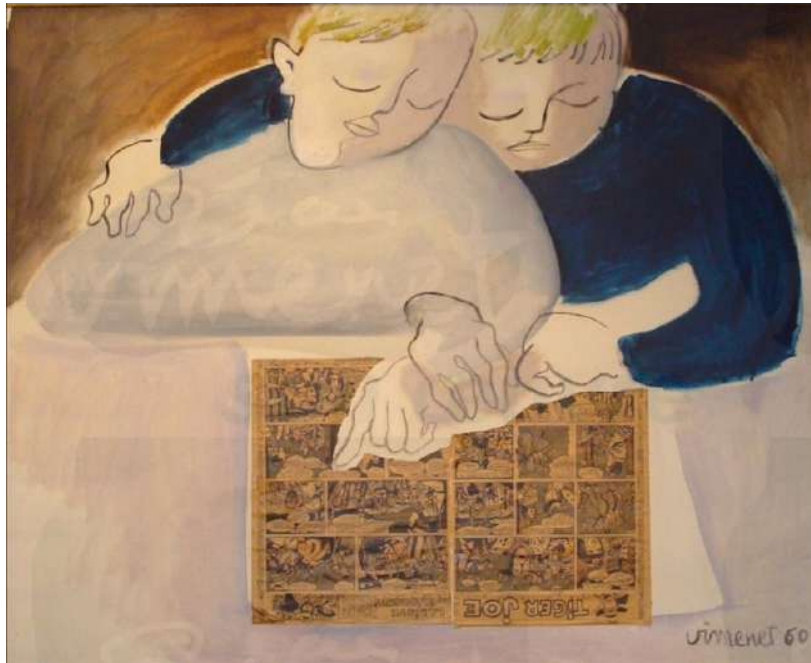
The Two Brothers , oil on canvas, printed comic strip, cut and glued, 81 x 100, Mondollot, 1960