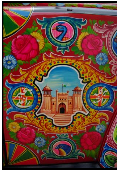
Islamabad to Paris